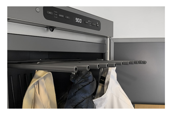
Model shown is TS 43